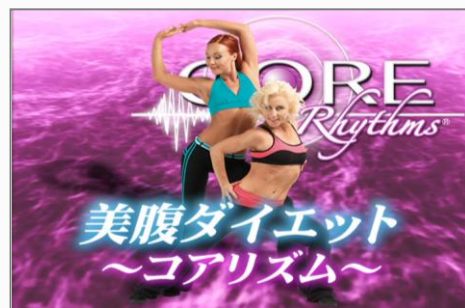
[Screen image of BeeTV & Core Rhythms]

OLM will continue to strive to provide contents that satisfy individual customer's needs and to support lifestyle enrichment for each and every customer.